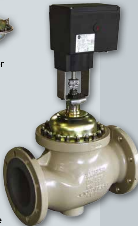
Electric control valve