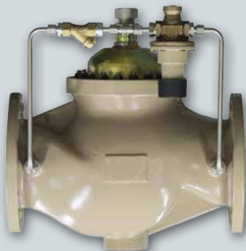
Pressure reducing valve